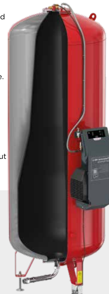
The Flamcomat MK-U G4 Remote comes with a replaceable butyl bladder.

The system as a whole sees the equipment as a traditional expansion vessel, comprising of a wet side and a dry (air cushion) side. The 'intelligent' difference is that as expanded water enters the vessel, the control system vents air from the gas cushion to allow the expanded fluid into the vessel without changing the pressure as a whole.