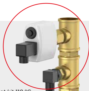
Flamcomat kit 110 °C