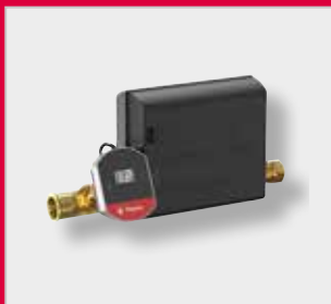
Flexcon PA Pressurisation Assistant