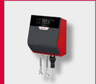
FlexFiller Direct G4 Pressurisation Unit