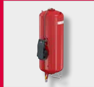
Flexcon MK-U Expansion Automat *