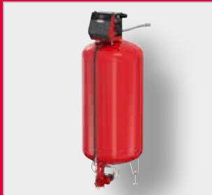
Flamcomat G4 MK-C Expansion Automat