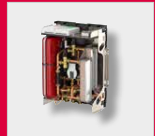
LogoEco Dual G2 Heat Interface Unit