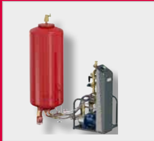
Flamcomat G3 Expansion Automat *