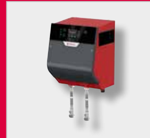
FlexFiller Mini Pressurisation Unit