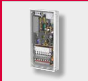
LogoMatic G2 Heat Interface Unit