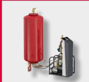
Flamcomat MP G4 Expansion Automat