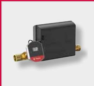
Flexcon PA Pressurisation Assistant