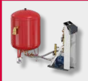
Flamcomat G4 Starter Expansion Automat