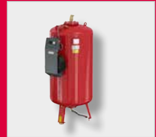
Flamcomat MK-U G4 Expansion Automat