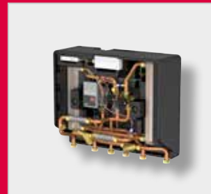
LogoEco G2 Heat Interface Unit