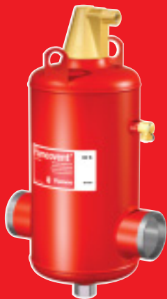
STEEL FLAMCOVENT WITH WELDED CONNECTIONS