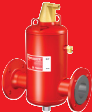
STEEL FLAMCOVENT WITH FLANGED CONNECTIONS

The Flamcovent air separators are used in sealed central cooling and heating systems up to a maximum temperature of 120 °C and a maximum pressure of 10 bar.